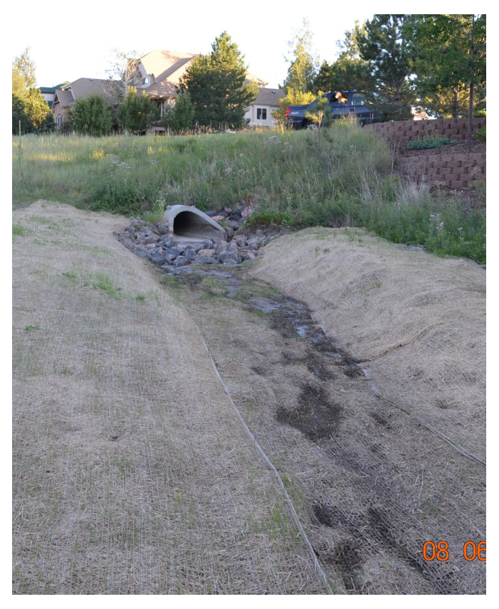
July 12, 2014 (Before)